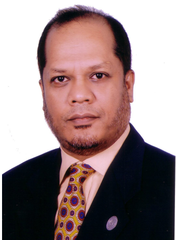
Sarwar Jahan Southern University Bangladesh